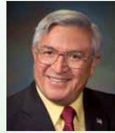
Mayor Cecil Gutierrez