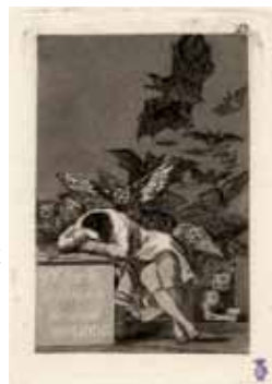
The Sleep of Reason Produces Monsters, 1799. F. Goya.

This exhibition features an early first edition of Los Caprichos, a set of 80 etchings by Spanish artist Francisco de Goya y Lucientes that was published in 1799. Admission: $5, free for Museum members.