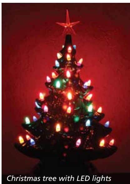
Christmas tree with LED lights

Another lighting technology also making inroads in the energy and cost-savings domain is light-emitting diodes (LEDs).